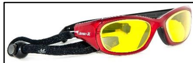
Laser-X® Radiation and Laser Protection

(L) SorbX™ radiation absorbing pads, shields and drapes. Absorbent and non-absorbent.